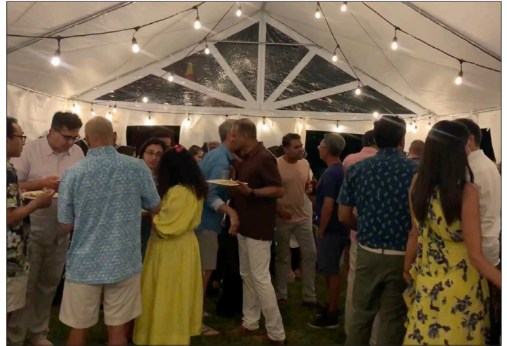
Friends enjoying the evening