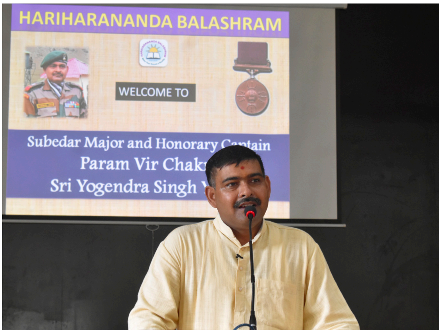
Param Vir Chakra Award Winner Sri Yogendra Singh Yadav

The students welcomed him in grand fashion with singing, dancing and ceremony and listened intently to his inspirational message. Sri Yogendra Singh Yadav is an inspiration to us all, especially to the young students of Balashram.