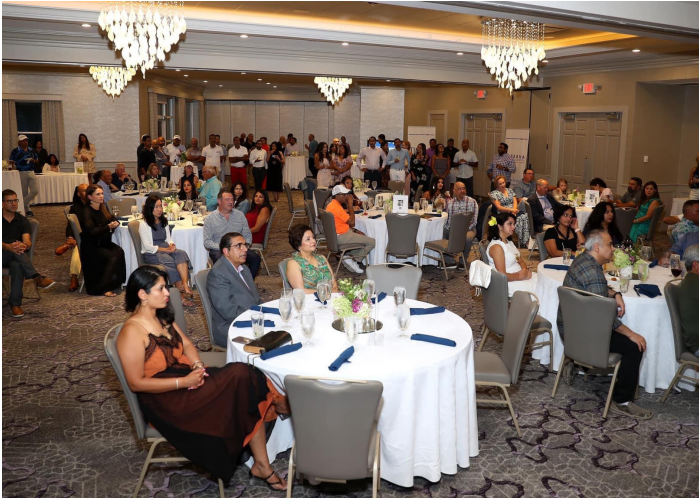
Evening reception and presentation in the ballroom