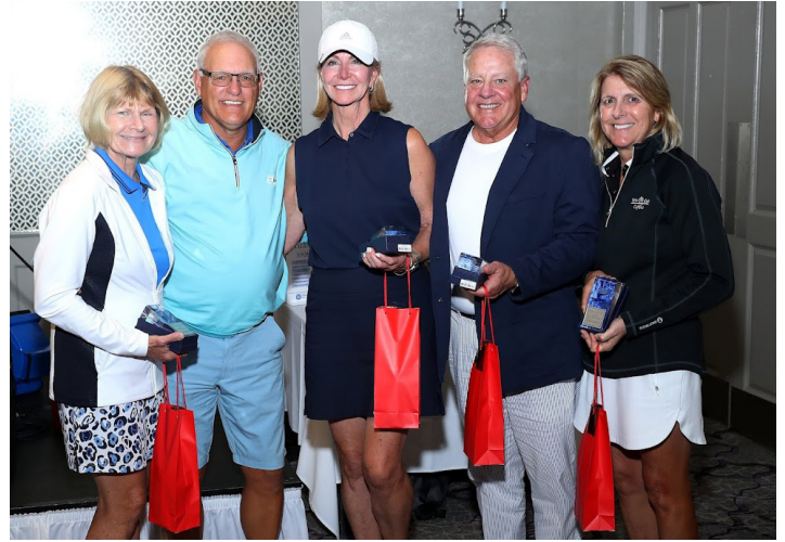
Trophy winners of the golf event