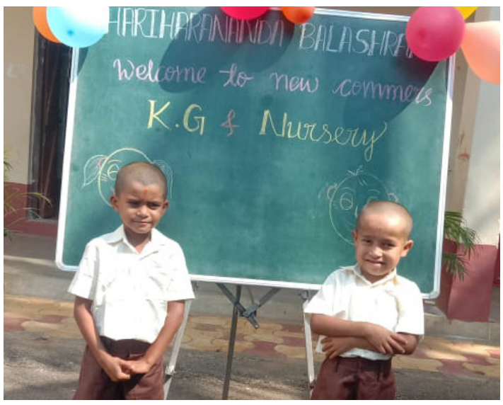
Balashram welcomes the new students

As old students were brought back to the school and continued their education, due to the Covid situation, Balashram was unable to enroll new students for the 2021-2022 school year until February at which time 39 Nursery (Pre-Kindergarten) and 46 Kindergarten students were admitted.