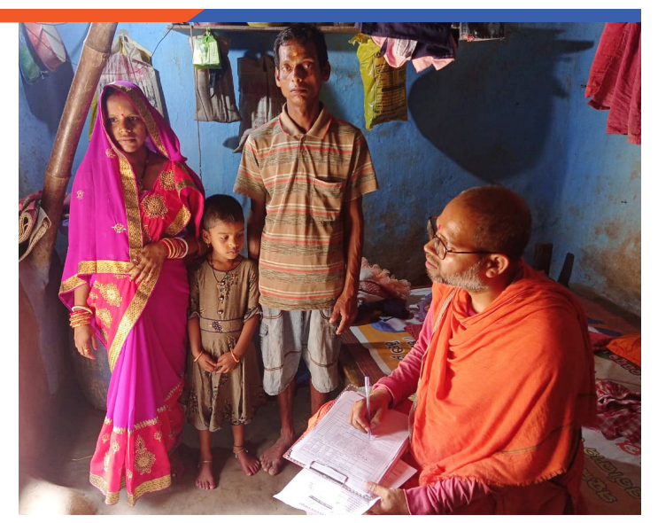
Balashram representative meets with a potential student

Returning to the regular recruitment schedule in April, Balashram representatives began scouting for the 2022-2023 Nursery class where approximately 40 more new students will be admitted. The scouting process involves visits to families and children in remote villages to assess the needs and circumstances of each child.