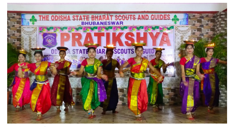
Students perform at camp

A state level national integration camp, called "PRATIKSHYA", was organized by the Odisha State Bharat Scouts & Guides and held March 13 - March 17. The Scouts learned about gender equality, good health and wellbeing, clean water and sanitation, climate action and poverty. Participants learned how to get along well with others, the importance of teamwork, clean-liness and punctuality. They also learned about the importance of discipline, how to politely and properly receive guests in one's home and how to cook. The Scouts and Guides Camp strives to help students live their best life once they graduate and have jobs, responsibilities and homes of their own.