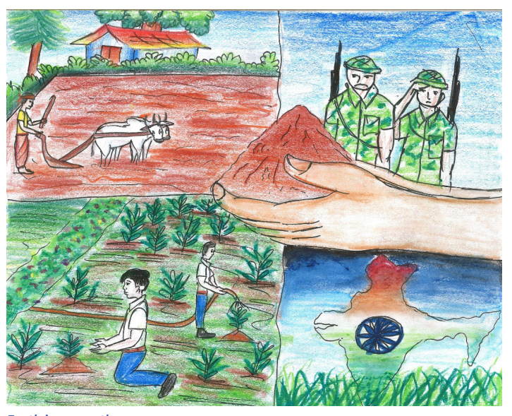
Earth is my mother

On the first day of camp, an art contest was held with the two themes, "My Village" and "Earth is My Mother". Below are a few of the winning pieces. Congratulations to all the students who participated!